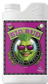
Big Bud Organic® OIM