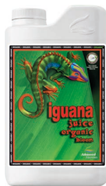
Iguana Juice Organic™ Bloom OIM