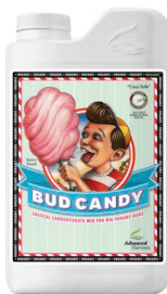
Bud Candy Organic™ OIM